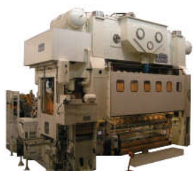
RAVNE TRANSFER PRESSES

One operator change dies. Extreme productivity increase. Simple & Low cost operation. Solution for any size of press or die. The same equipment for different die sizes.