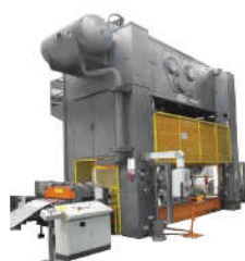
RAVNE PROGRESSIVE DIE PRESSES