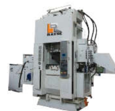
RAVNE PRECISE CUTTING