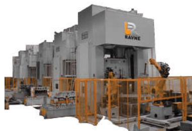
RAVNE TANDEM LINES